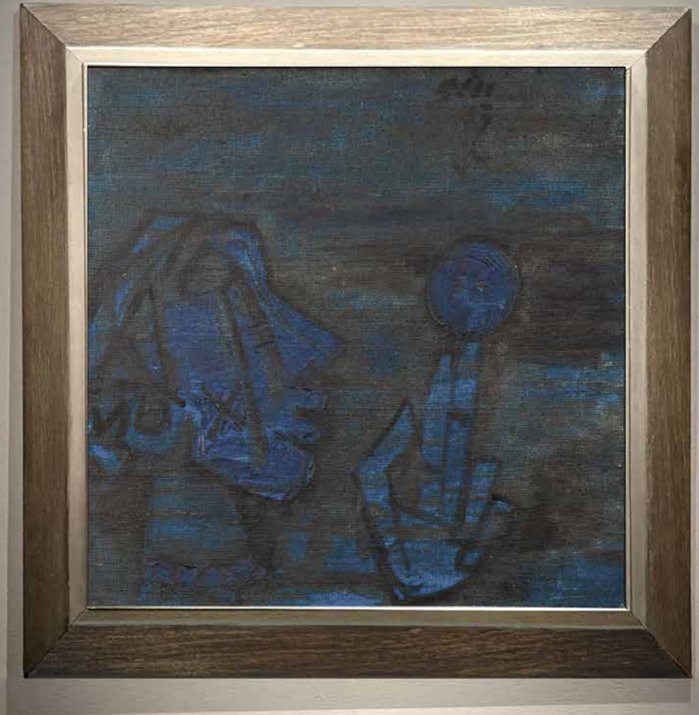
Maqbool Fida Husain (1915 - 2011)

Untitled 23.5 × 23.5 inches Oil on canvas pated on board