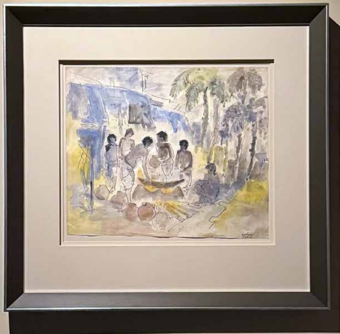
Ramkinkar Baij (1906-1980)

Untitled 18 × 21 inches Watercolor on paper 1957