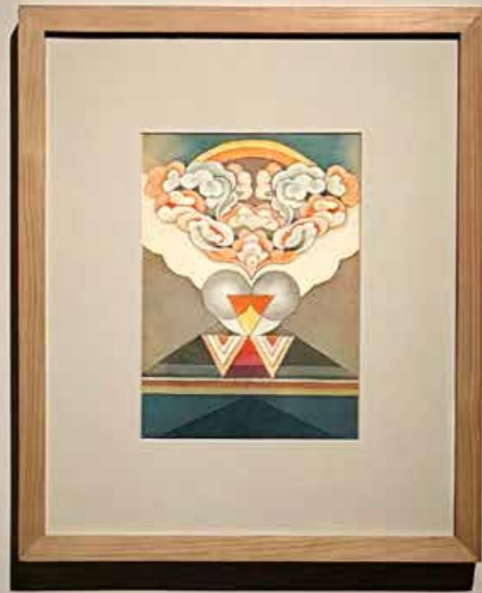
Ghulam Rasool Santosh (1929 - 1997)

Untitled 9 × 6.25 inches Watercolor on arches paper